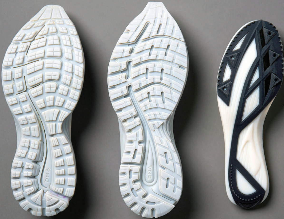
3D printed shoe midsole and outsole prototypes created by Brooks Running