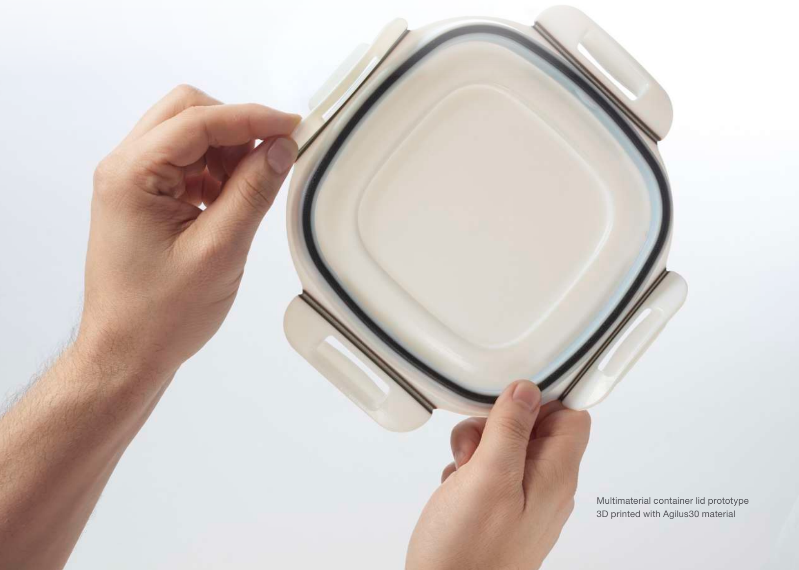
Multimaterial container lid prototype 3D printed with Agilus30 material

And if you need full-color capabilities down the line, the J850 Pro can be upgraded to meet those needs.