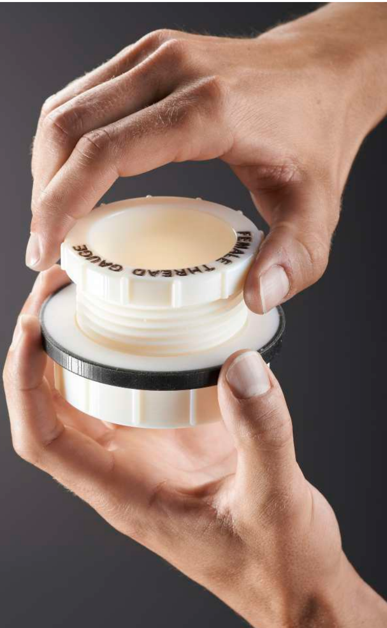
Threaded gauge prototype with male and female components

Use the Agilus30™ material family to create flexible parts and prototypes that can flex, bend, elongate and seal.