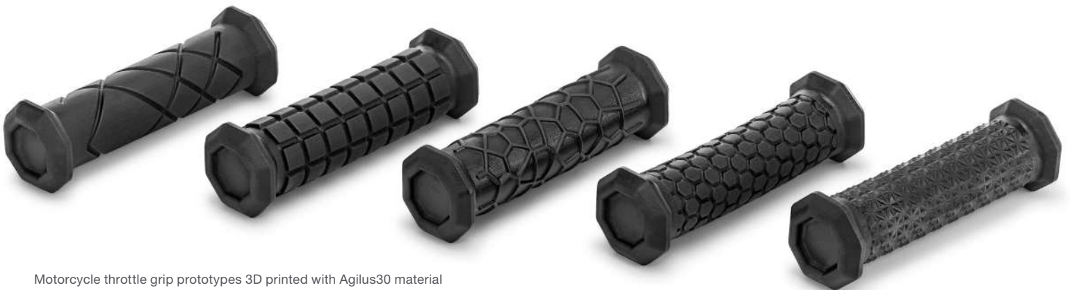
Motorcycle throttle grip prototypes 3D printed with Agilus30 material

With the J850 Pro, it's simple to create functional, multimaterial models that let you test and validate prototypes faster, and move through stakeholder review with ease. This leads to quicker decisions and approvals, helping you achieve product verification, increase throughput and save valuable time.